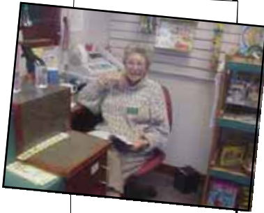
Tending to business

Since 1978, Friends of the Library has provided additional financial support for Library programs, materials,