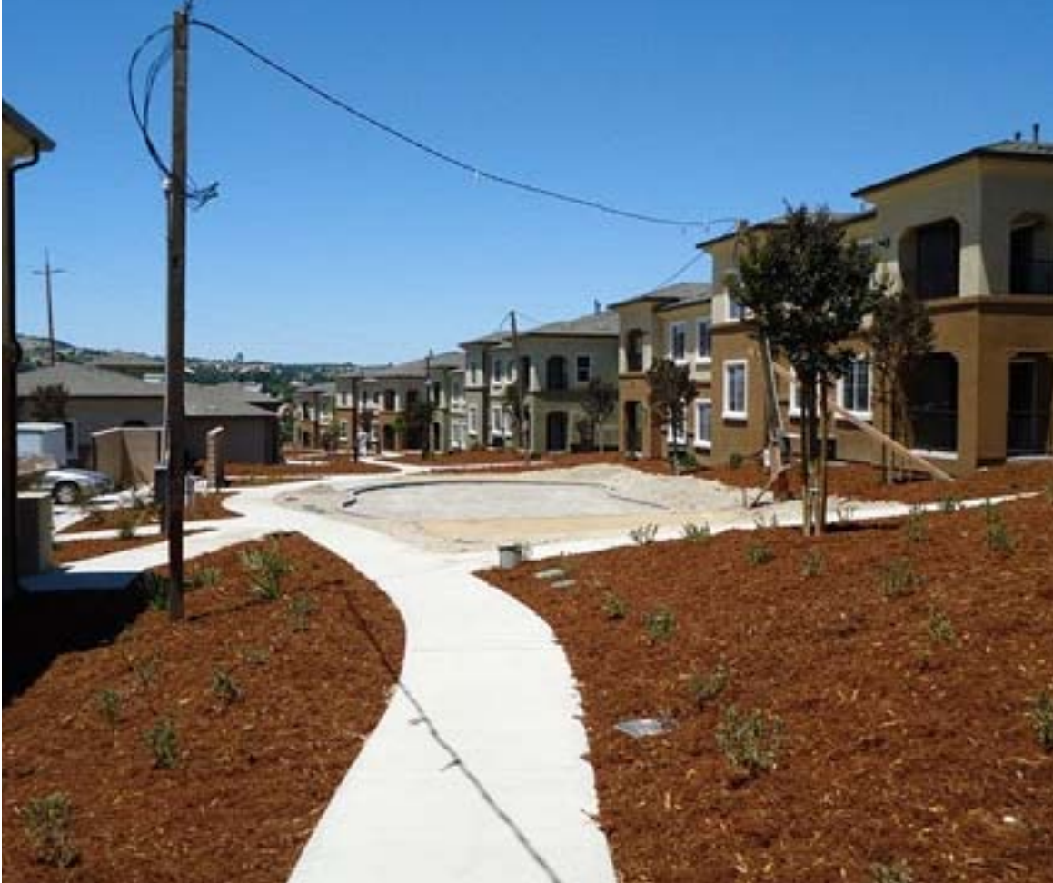
Hidden Creek Village - Nearing Completion

TOTAL NUMBER OF RESIDENTIAL UNITS WITH ENTITLEMENTS.....701