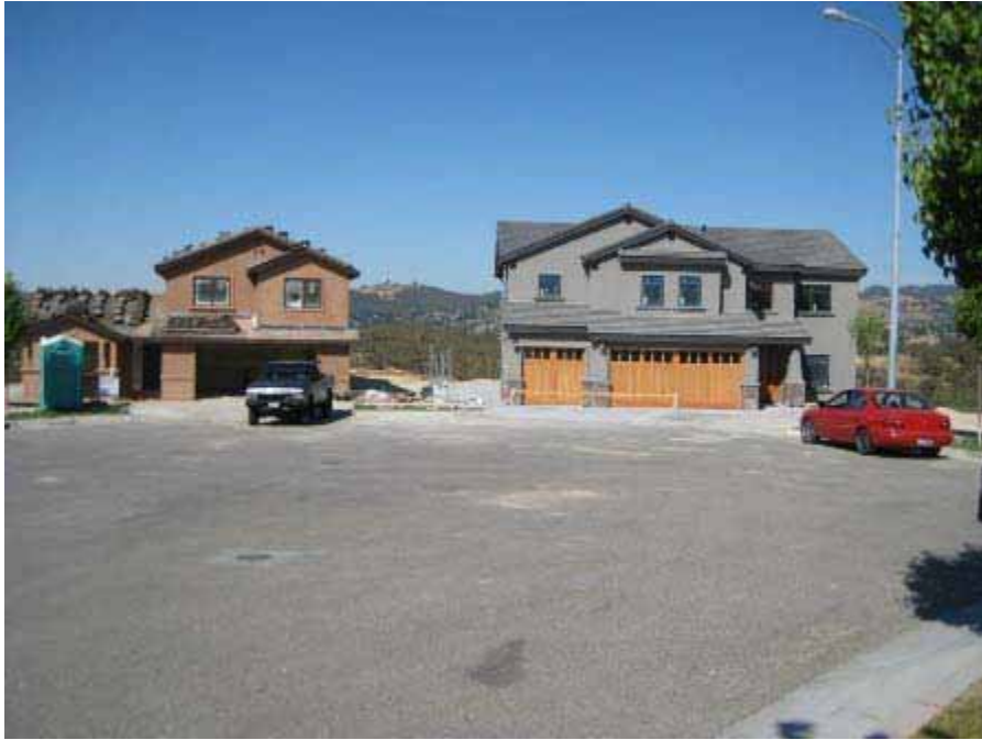
Montebello Oaks (Tract 2369)

TOTAL NUMBER OF RESIDENTIAL UNITS WITH ENTITLEMENTS.....768