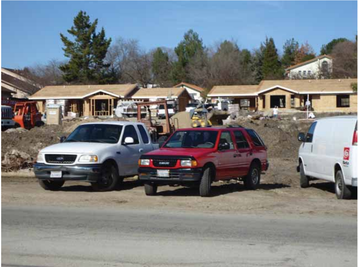
New Single Family Homes Under Construction, 935 - 949 Creston Road