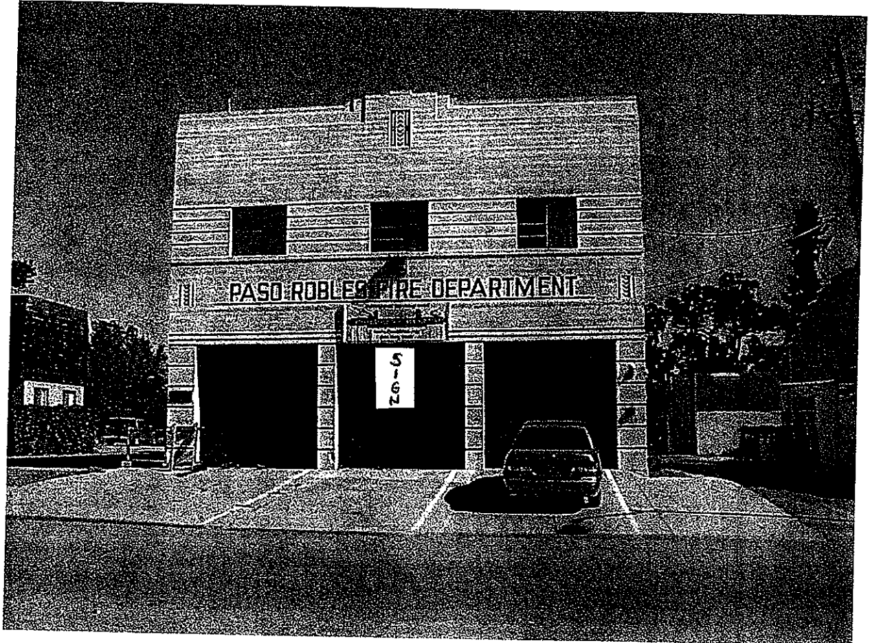
Attachment 3 Photo of building showing proposed sign location.