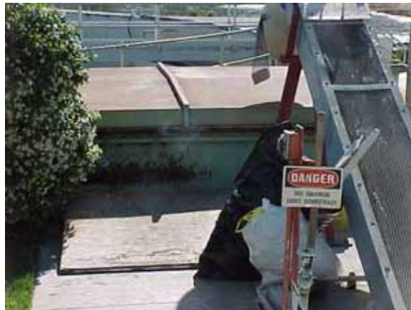
Holding Bin for solids

Note: Currently solids are hauled manually via wheelbarrows.