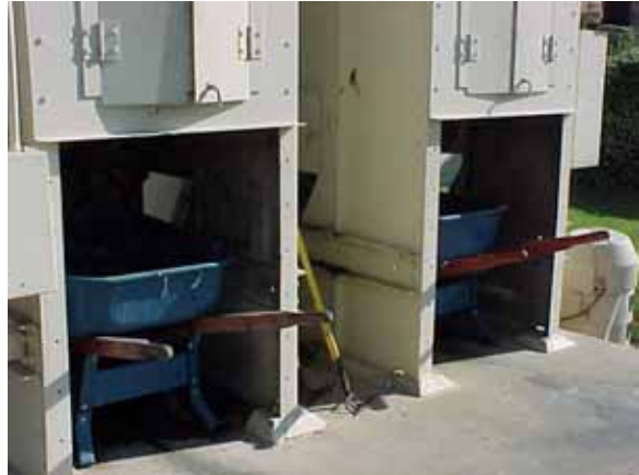
Existing Screening Equipment

Note: Currently solids are hauled manually via wheelbarrows.