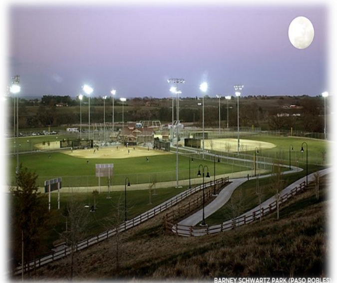
BARNEY SCHWARTZ PARK (PASO ROBLES)