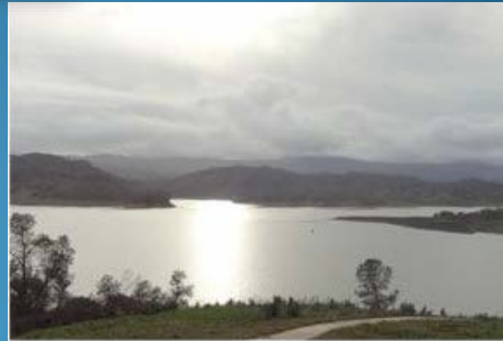
January, 11 2017