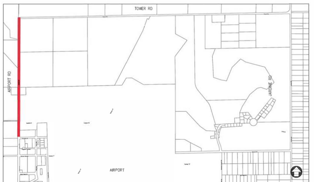
INSET: AIRPORT AREA WORK

COLOR LEGEND — COMPLETED & SCHEDULED WORK